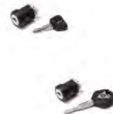
39L/50L Top Case City Lock Set