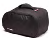
39L Top Case City Inner Bag