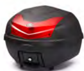
39L Top Case City