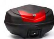
50L Top Case City

For all MT-09 accessories go to the website, or check your local dealer