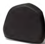
39L Top Case City Passenger Backrest