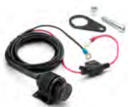
12V DC Outlet MT-09